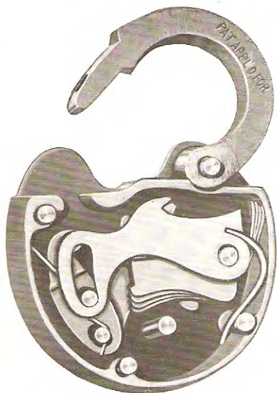
ADLAKE No. 650 Signal Box Lock